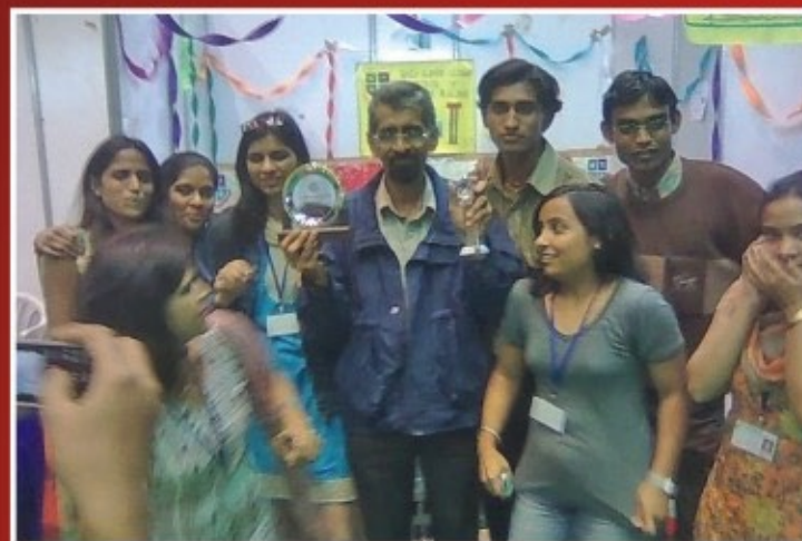
MBA team Awarded for product innovation at IMI Carnival in Nov. 2009