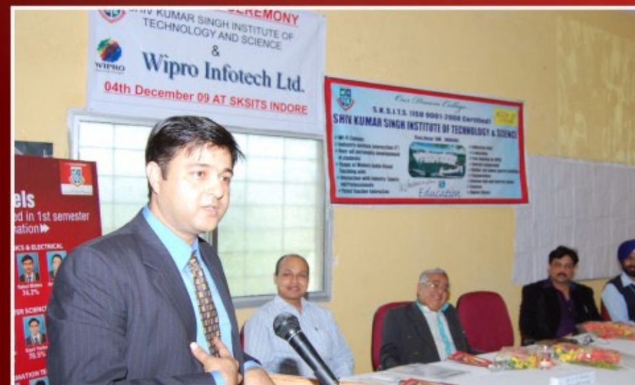
At the occasion of MOU Shining ceremony