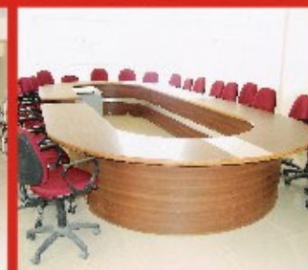
Elite conference room