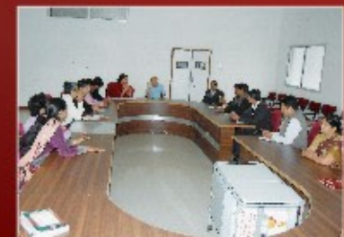
Knowledge disseminators Our Faculty Members