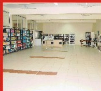
Open access library